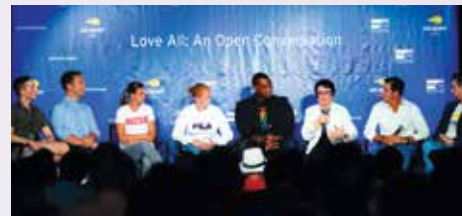
Pride @ US Open