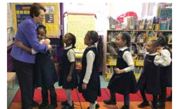
Billie Jean King and students from Girls Prep Lower East Side, NYC.

The BJKLI worked with Pearle Vision to spread the message to young people everywhere that having glasses does not limit potential, only strengthens it.