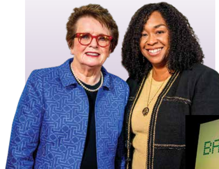
Billie Jean King and Shonda Rhimes

On September 19, 2017, the BJKLI convened leaders from a variety of sectors to hear from Emma Stone, Billie Jean King, Shonda Rhimes, and Christiane Amanpour on the importance of equity, inclusion, and the power of the individual to make change. The event honored two trailblazers and game-changers who have used the power of television to elevate the stories of those who were once without a voice.