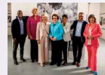
BJKLI Equity Allies