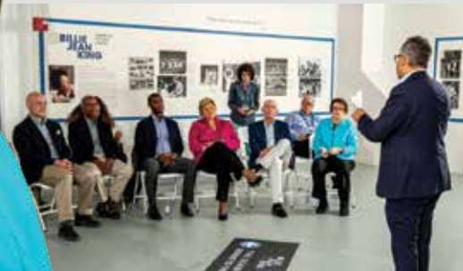
BJKLI Equity Allies