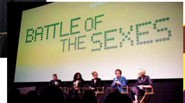
Shonda Rhimes, Valerie Faris, Billie Jean King and Emma Stone discuss the Battle of the Sexes movie.