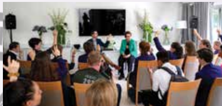
Pride @ Wimbledon

INCLUSIVE LEADERSHIP AT THE ALL ENGLAND LAWN TENNIS CLUB